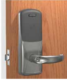
Cylindrical Lock (AD-300/400-CY)