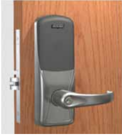
Mortise Lock (AD-300/400-MS)

AD-Series Electronic Locks from Schlage are built from the ground up to provide more options, more functionality and more compatibility than any other solution on the market today. Designed to suite with the most popular lever styles and finishes, Schlage AD-Series locks can be configured to accept most major key systems.